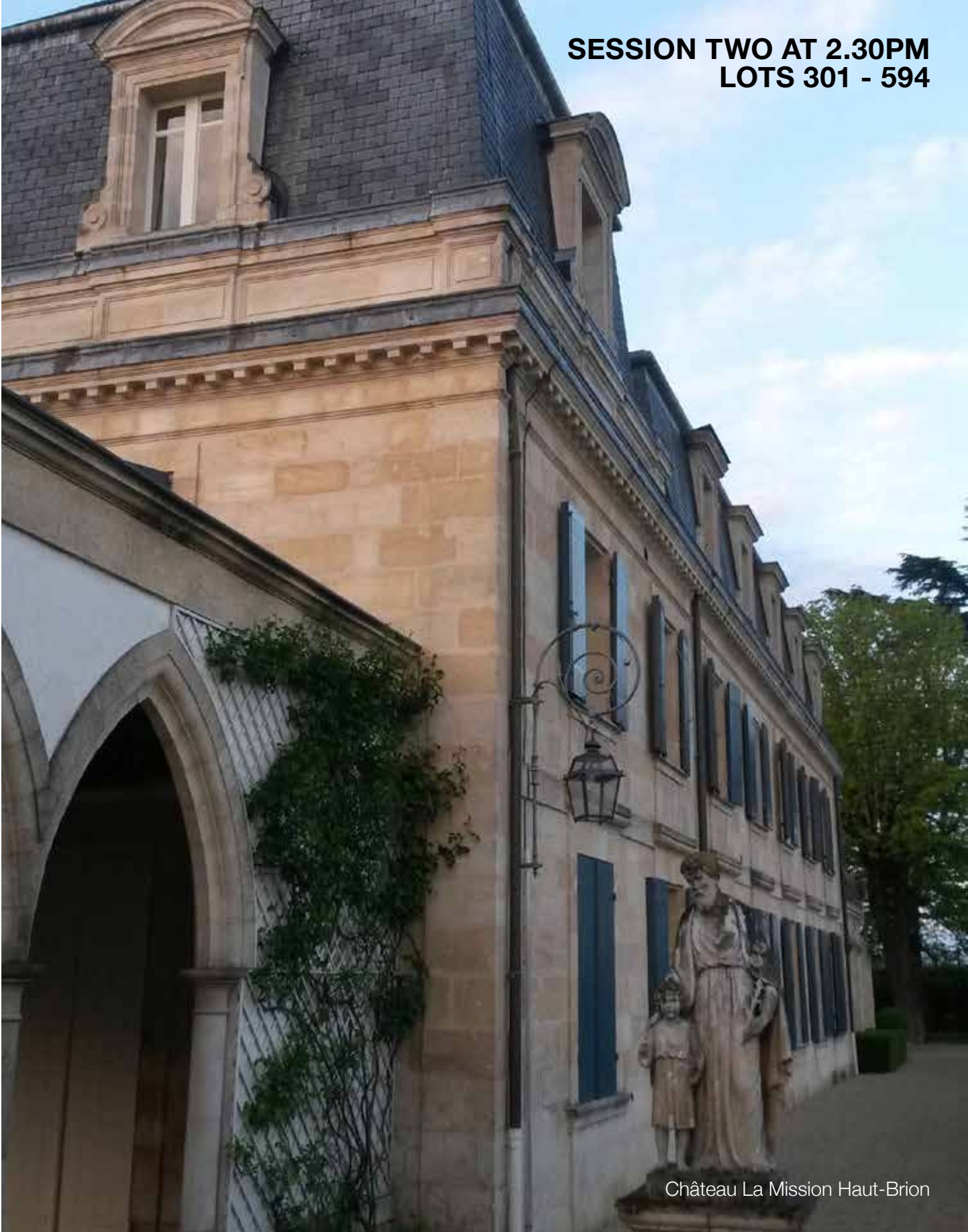
Château La Mission Haut-Brion